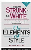
The Elements of Style, Fourth Edition, by William Strunk, Jr.

For an excellent source on English composition, check out this classic book by William Strunk, Jr. on the Elements of Style. Contents include: Elementary Rules of Usage, Elementary Principles of Composition, Words & Expressions Commonly Misused, An Approach to Style with a List of Reminders: Place yourself in the background, Revise and rewrite, Avoid fancy words, Be clear, Do not inject opinion, Do not take shortcuts at the cost of clarity, ... and much more. Details of The Elements of Style by William Strunk, Jr. partially available online at Bartleby.com . Note: William Strunk, Jr. (1869–1946). The Elements of Style was first published in 1918.