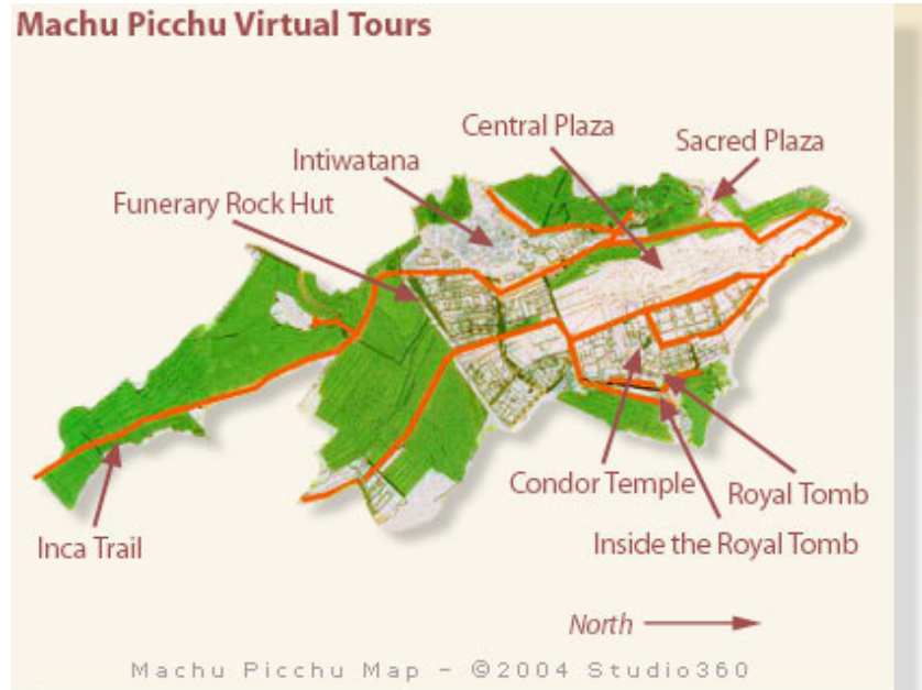
Figure 1: This map illustrates the location of the Inca trail in relation to the historical site of Machu Picchu.