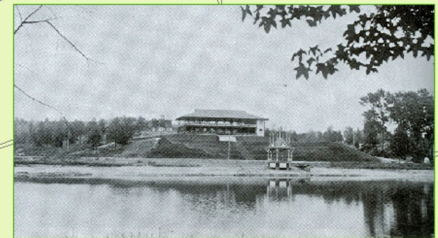
2 1901- View across from Westhampton Lake: gazebo and two-story pavilion that provided a restaurant and dance hall to the Westhampton Park community center. The pavilion in the photograph was replaced by the Boatwright Library.