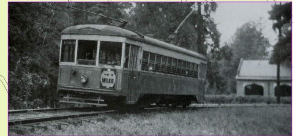
1 1946- Richmond street car en route to the city from it's final stop at the University. The brick waiting shelter that still stands today can be seen in the background.